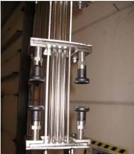
No contractual picture