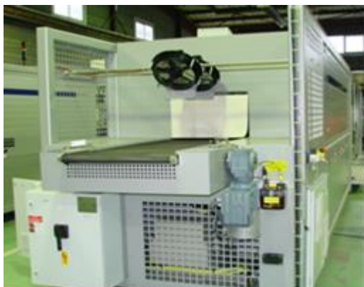
No contractual picture